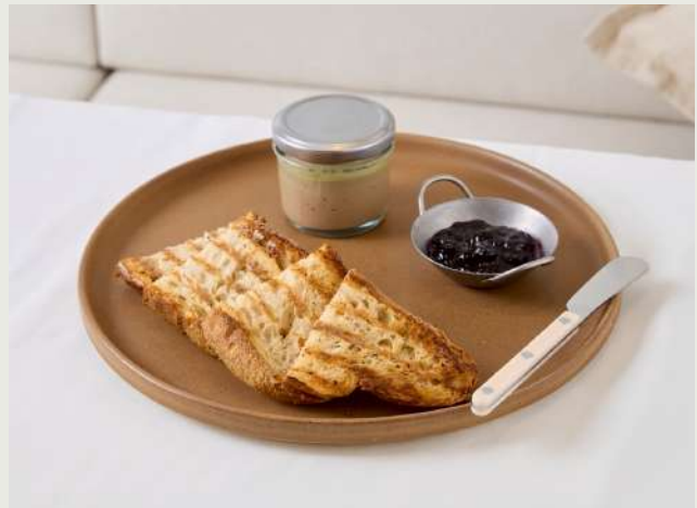
Liver Pate with Baguette — 240 Chicken liver pate, homemade jam, warm baguette.