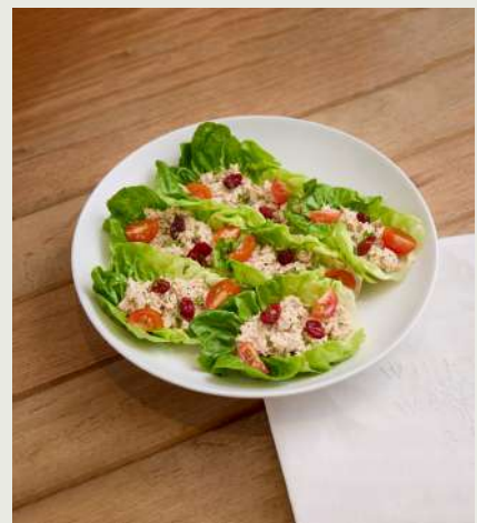
Cosy Tuna Bites — 220 Baby cos (5 pieces) with tuna mayo, sesame soy dressing, and cranberry dressing.