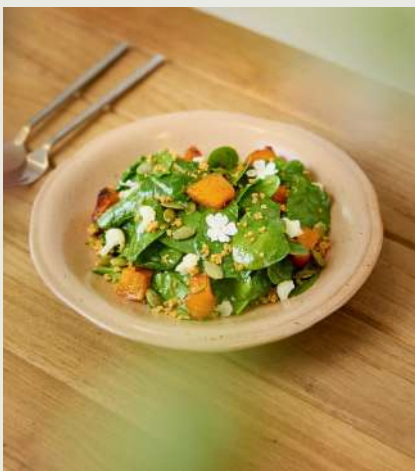
Baby Spinach Salad with Miso Pumpkin & Quinoa — 220 Miso pumpkin, spinach, crispy quinoa, green apple