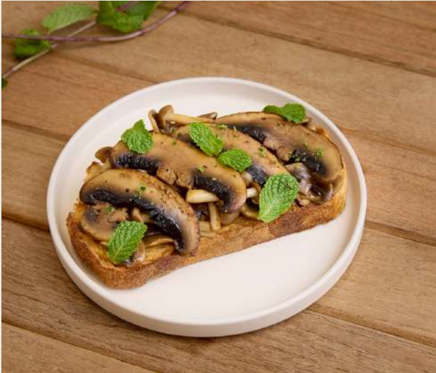
Mixed Mushroom Toast — 220 Portobello, champignon, shimeji sautéed mushrooms on warm sourdough, herbs and seeds.