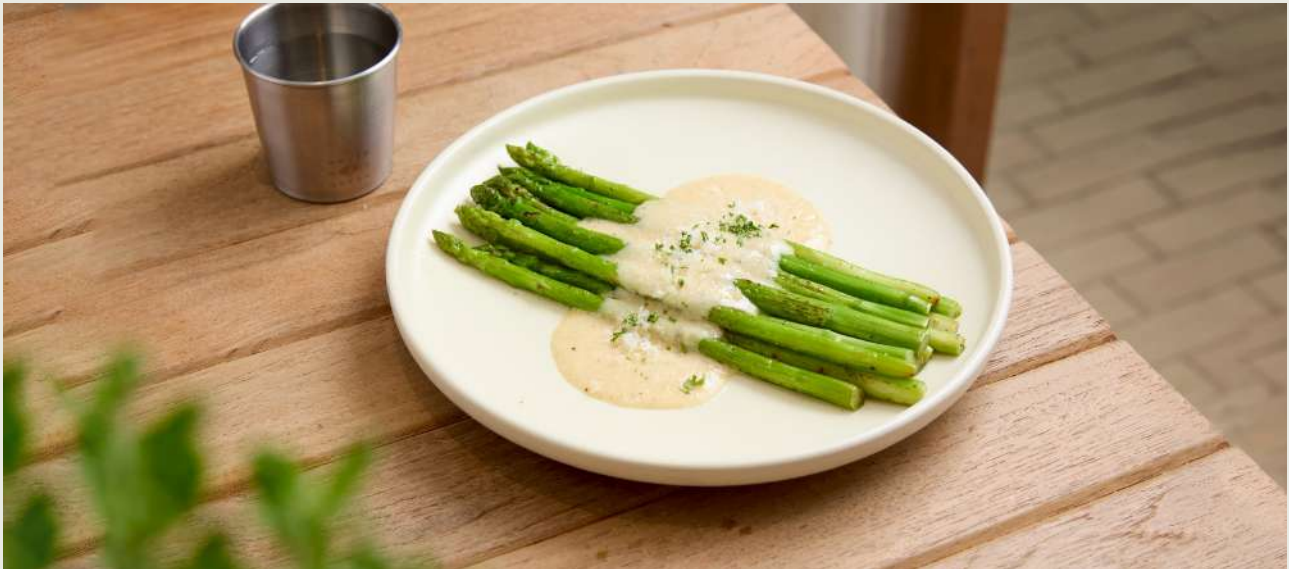
Grilled Asparagus — 240 Lightly Charred asparagus and parmigiano sauce.