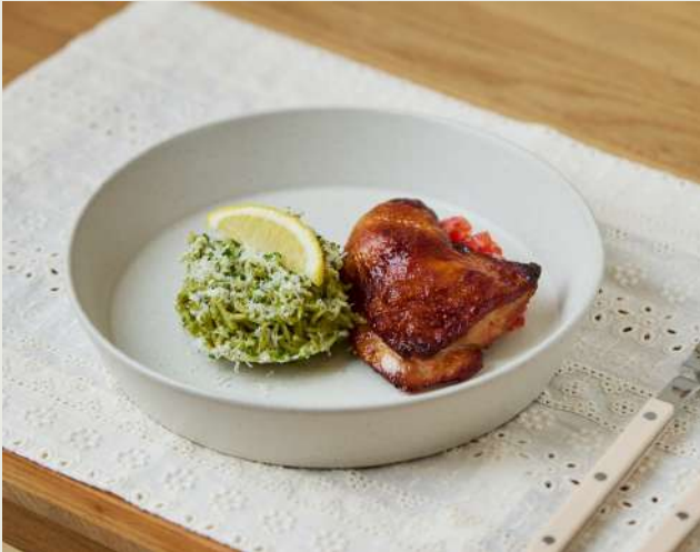
Chicken Pesto Rice — 360 Grilled chicken, basmati rice, pesto, tomato salsa. 🌿