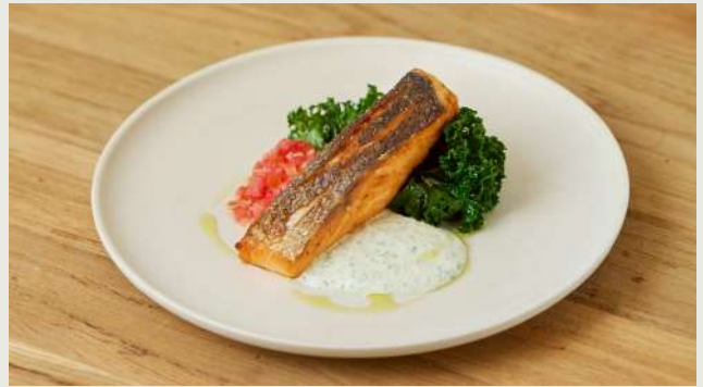
Salmon Steak with Yogurt Dill Sauce — 430 Pan-seared salmon, yogurt dill sauce, rocket.