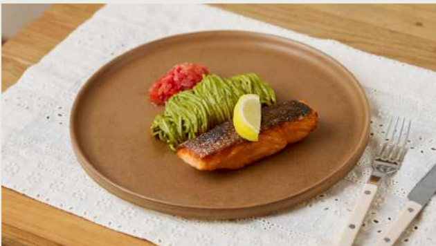
Pesto Salmon Pasta — 450 Pan-seared salmon, pesto, roasted cherry tomatoes.