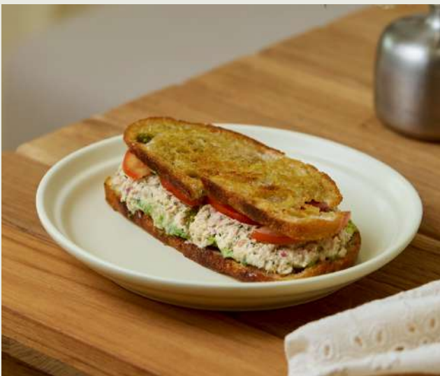
Tunacado — 280 Sourdough toast, tuna mix, avocado, fresh tomatoes.