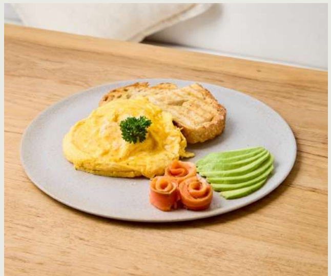
Eggs & Toast — 190 Choice of swirl eggs or an omelette, served with sourdough toast and a mixed salad with balsamic dressing.