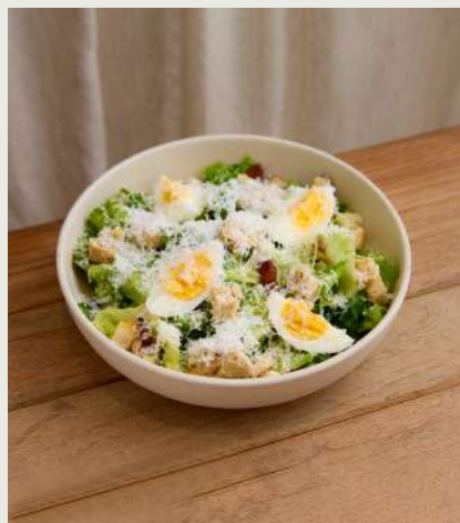
Chicken Ceasar Salad — 260 Crisp cos lettuce, chicken, parmesan, toasted crumbs and house Caesar dressing.