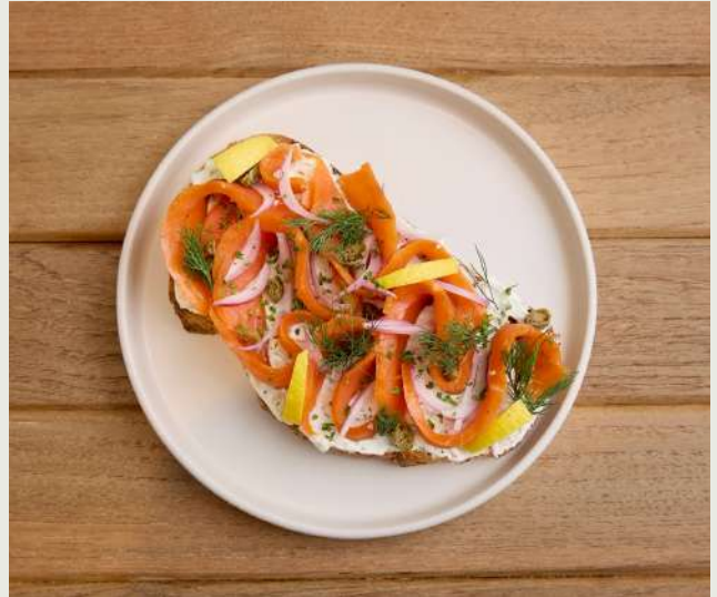
Smoked Salmon Cream Cheese on Toast — 250 Sourdough toast with cream cheese and smoked salmon with capers.