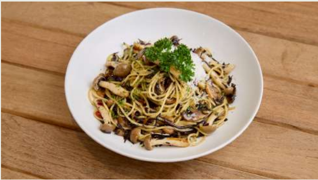
Mushroom Hijiki Aglio e Olio — 240 Wild mushrooms, brown shimeji, olive oil, Hijiki, garlic, chili flakes, parsley.