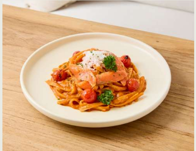
Fettuccine Smoked Salmon Pink Sauce — 380 Smoked salmon, tomato cream sauce, roasted cherry tomatoes. 🌿