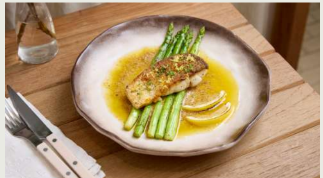
Seared Seabass with Lemon Butter — 340 Pan-seared seabass, roasted asparagus and delicate lemon butter sauce.