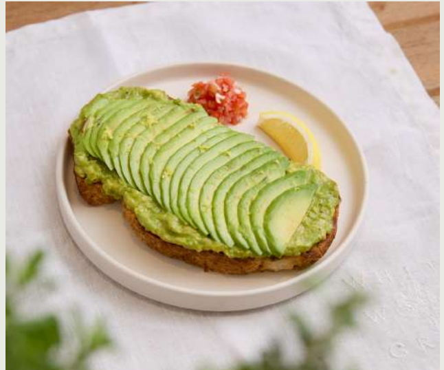
Avocado Toast — 260 Smashed avocado, sourdough, tomato salsa, lemon.