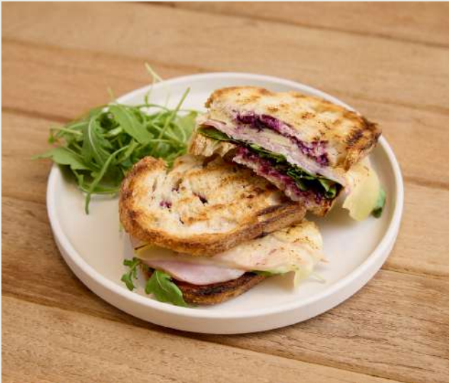
Ham & Cheese Sourdough — 240 Smoked Ham, emmental, homemade jam, rocket.